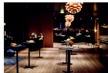
▲ Photocredit: © Langelinie Pavillon